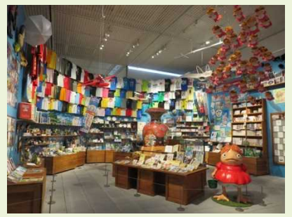
An endless number of valuable materials, including promotional materials for movies and goods