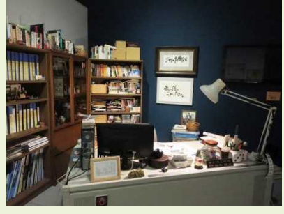
A corner reproducing the office of Toshio Suzuki, famous producer of Studio Ghibli

How were Ghibli works produced? How were they released to the world? With a focus on advertisement and publicity materials, like posters and leaflets reminiscent of the age they were published in, a nearly overwhelming number of materials as of yet to be revealed to the public, including production materials and plans, overflow and consume every inch of the exhibition's free space. From children to adults, this exhibition is required viewing for Ghibli fans.