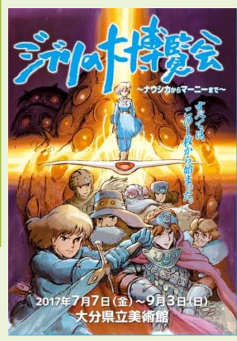
風の谷のナウシカ © Studio Ghibli · H

Visit the OPAM website for more details: http://www.opam.jp/exhibitions/detail/228