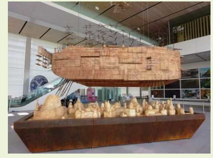
A moving replica of the giant airship from "Castle in the Sky"

XAII photos shown are from the Oita exhibition