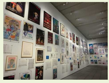
From "Nausicaä" to "Marnie," posters from each era and valuable key animations