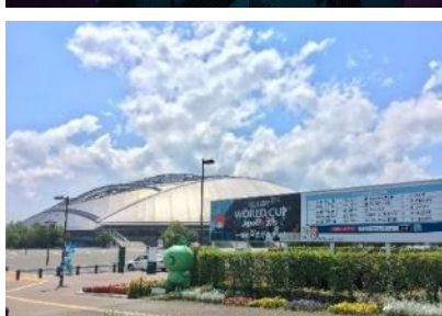
Oita Sports Park, designated venue for upcoming matches in Oita.