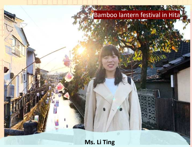
Traineeship programme cadet from China Placement in Oita Prefecture: May 2019 ~ Nov 2019

HOW HAVE YOU BEEN? is a column that talks about what past CIRs and other affiliates of the Oita Prefecture have been up to.