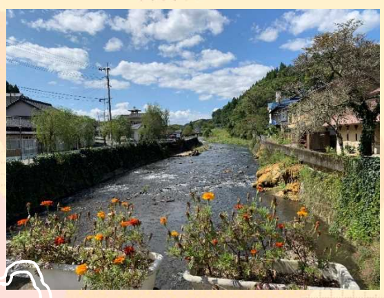
Around Ganiyu, a famous spot at Nagayu Onsen

A year has passed since I left Oita. I am continuing my studies in the Japanese language through listening to NHK news and watching TV dramas. Even now, memories of Oita Prefecture, especially those of the carbonated onsen at Nagayu, bring about a wave of nostalgia. I had travelled to the onsen on bus in autumn, and was mesmerised by the scenery on the other side of the window. Having made an overnight stay, I managed to enjoy the onsen without any rush. At the time, I thought enviously about how happy the neighbourhood must feel to live so close by an onsen.