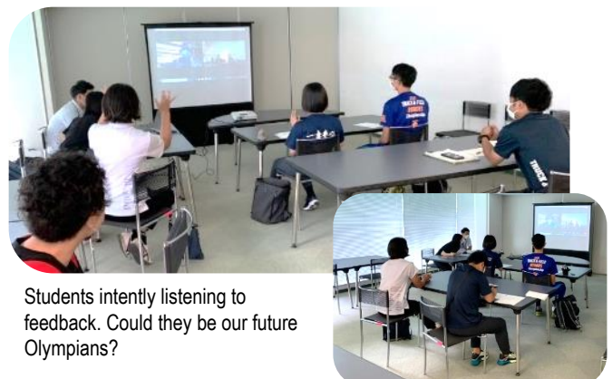
Students intently listening to feedback. Could they be our future Olympians?