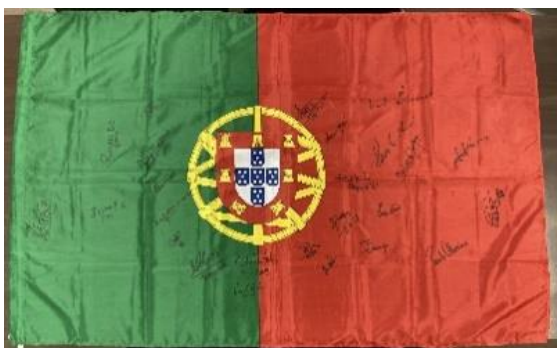
Portuguese flag with signatures from FPA athletes.

After the closing of the Olympic Games on August 8, the Paralympic Games will run from August 24 to September 5. Although the world is still facing restrictions in communication due to the COVID-19 pandemic, the experiences with overseas athletes have made an impression in the hearts of Oita's people. We greatly look forward to seeing more out of these connections in the future.