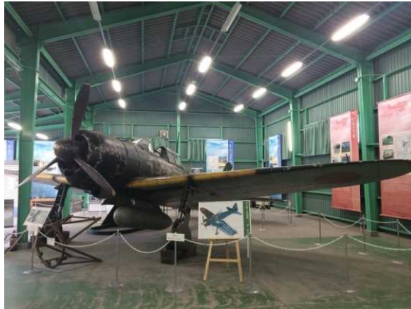
Fighter plane model at the Usa Peace Museum

Despite its modest size, the museum is fascinating and informative, and the staff were eager to answer any questions that I had. But the museum provides more than just facts and figures. Although