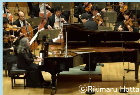
Performance in Tokyo on May 17

For more information, please go to ■ http://www.argerich-mf.jp/haus/