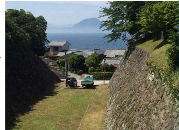
Beppu Bay from the Hiji Castle Ruins

However, not everything changes. Beyond the elementary school, you can still see the natural beauty of Beppu Bay, the same as always.