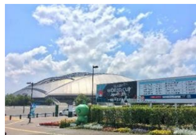
Oita Sports Park, designated venue for upcoming matches in Oita.