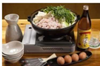
Buta-horomon (pork offal), Bungo-ono