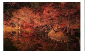
Yujaku Park, Bungo-ono