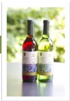
Ajimu Winery, Usa