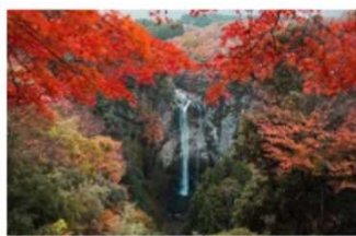
Fukino Waterfall, Usa