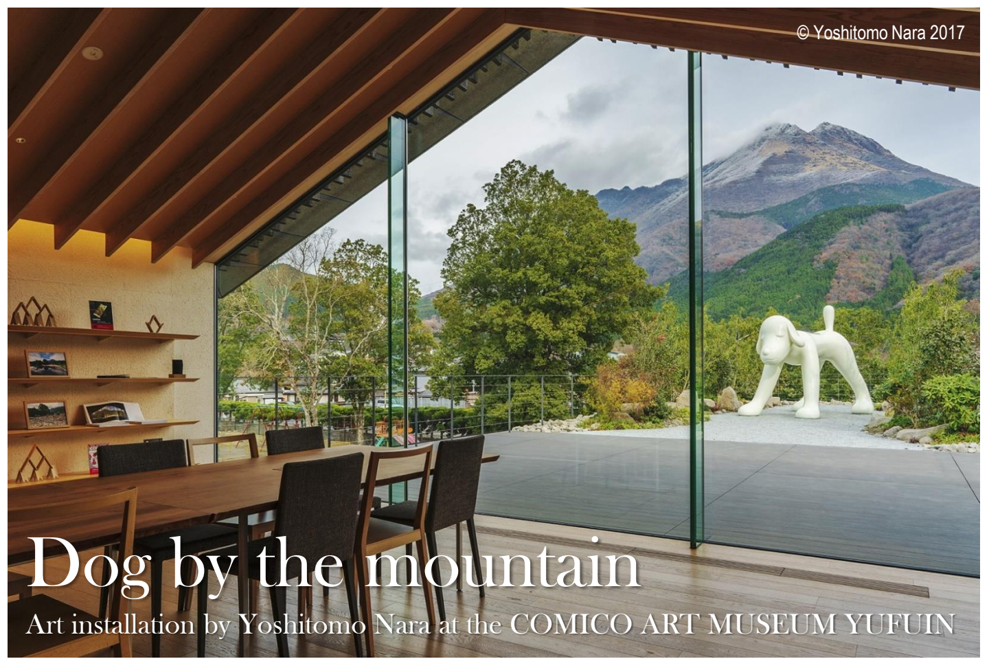
What's up, OITA! 2020 February, No. 45

Looking at the smart and dark Japanese cedar façade leading to the entrance, I once again step into the COMICO ART MUSEUM YUFUIN. The art museum was introduced in No. 35 of the English version of What's up , Oita!* , and it is with great delight that I revisit the facility to enjoy an new exhibition.