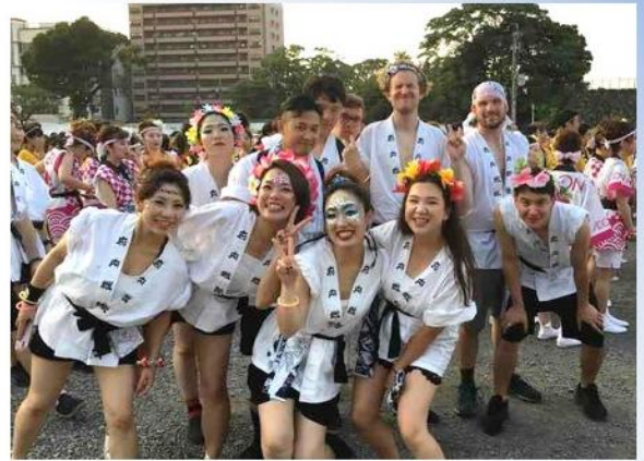
Participating with friends in Oita's summer Funai Pacchin